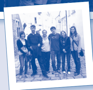
Some of the team the day before the conference, on a beautiful cobblestone road in Bratislava.