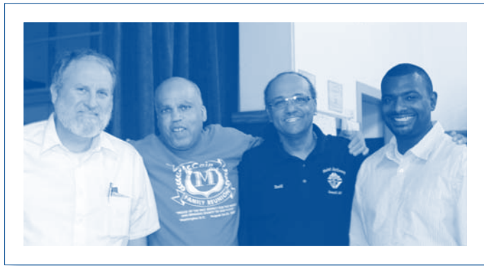
Four Discovering Christ participants at St. Anthony's in DC

At St. Anthony's parish in DC many shared at the final session how God touched their lives through Discovering Christ . The course helped one participant "put Jesus in the center in my life, whatever I do, wherever I am. I realize more and more how much I need Him in my life." Another