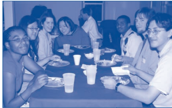
Small group dinner

As a participant in this course, I can testify to the impact that it has had on my life and the lives of many other young adults. This past week my small group discussion was about the love of God as our Father and how it is constant no matter what we do or how many times we fall. It was a tear filled conversation as we reflected on our own failings and the freedom that comes with surrendering them to the Lord. We ended the discussion each saying a brief prayer giving our individual bur-